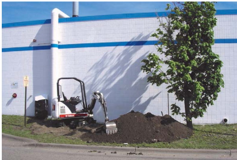
Right Image: Side-by-Side Installation